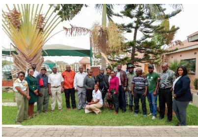
Project launch in Choma