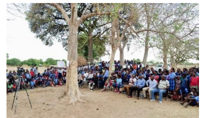
Awareness campaign in Mabala