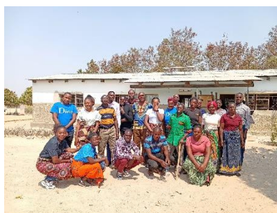
Community training in Siachidinta